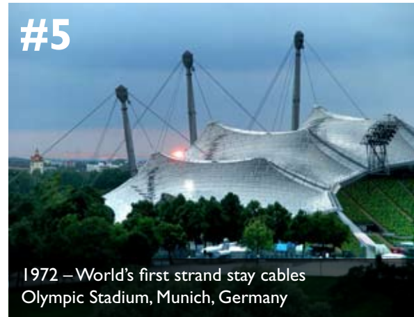
#5 1972 – World's first strand stay cables Olympic Stadium, Munich, Germany