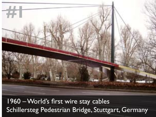
#1 1960 – World's first wire stay cables Schillersteg Pedestrian Bridge, Stuttgart, Germany