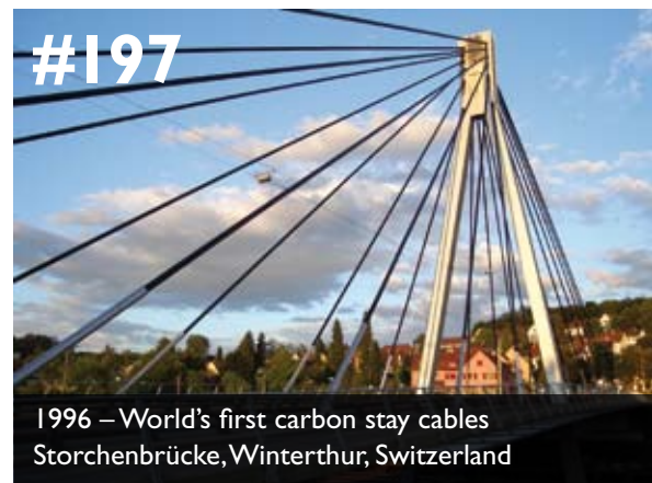
#197 1996 – World's first carbon stay cables Storchenbrücke, Winterthur, Switzerland