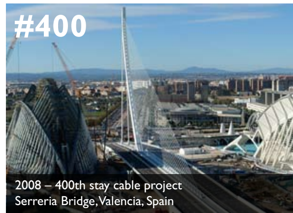
#400 2008 – 400th stay cable project Serreria Bridge, Valencia, Spain