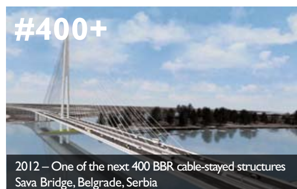
#400+ 2012 – One of the next 400 BBR cable-stayed structures Sava Bridge, Belgrade, Serbia